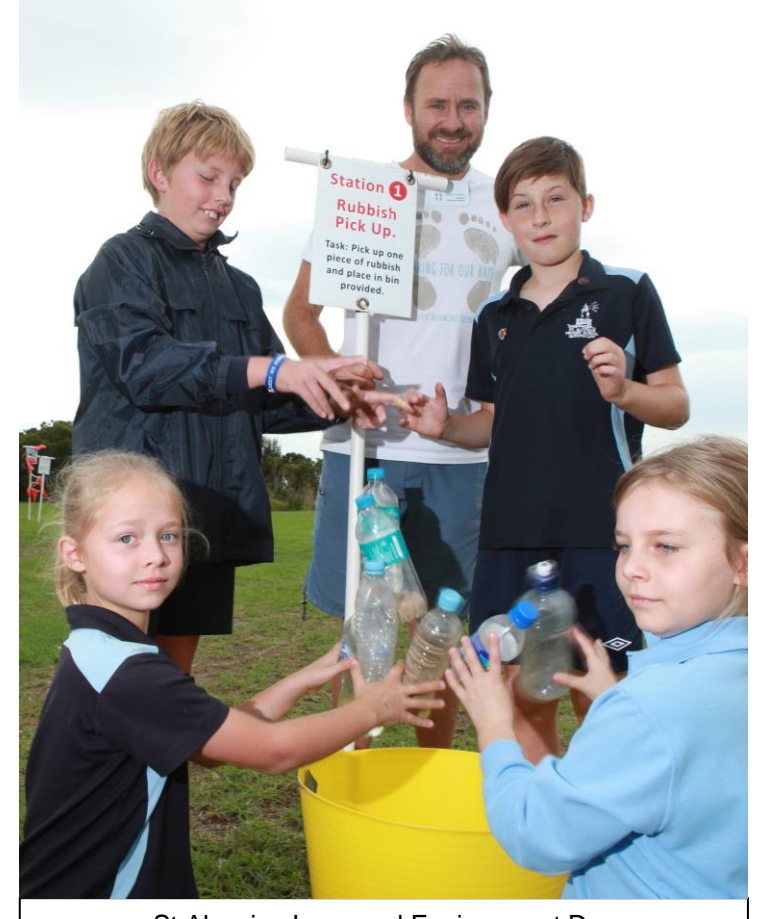
St Aloysius Inaugural Environment Day at Swan Bay Queenscliffe

In conclusion I would like to thank the entire Network, Staff and all delegates for their ongoing contribution and commitment to their particular group, organisations and to the BCN.